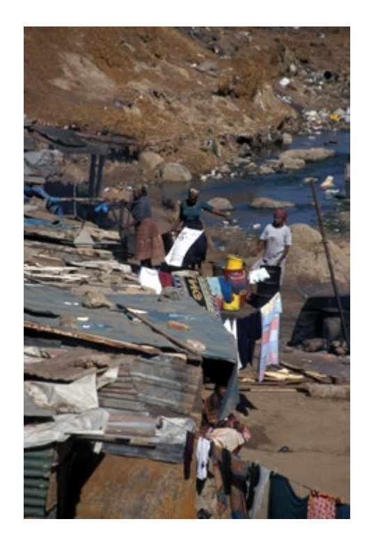
FIG PUBLICATION 67