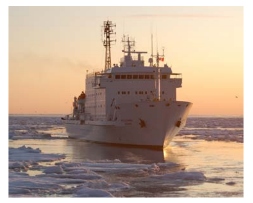
Figure 5: Escorting Akedemik loffe out of the ice.