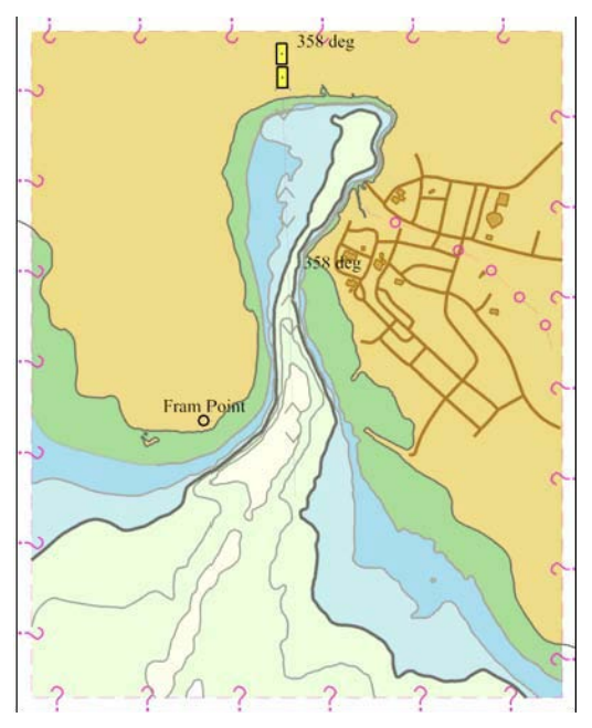
Figure 8. S-57 ENC of Gjoa Haven.

oil and gas development, fishing, national sovereignty, national defence and coastal zone management. The concept of hydrography as an investment not only applies to economic development in Canadian Arctic but to other developing lands worldwide.