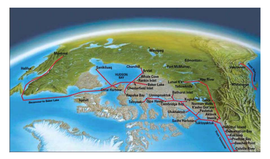
Figure 2: An Arctic Perspective