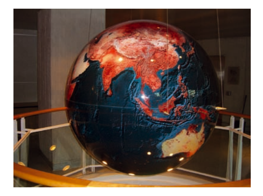
FIG PUBLICATION 45

Land governance is about the policies, processes and institutions by which land, property and natural resources are managed. This includes decisions on access to land, land rights, land use, and land development.