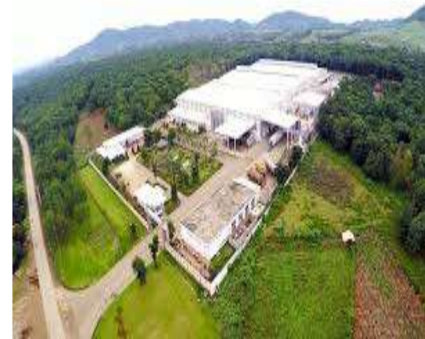
Farm TH true milk