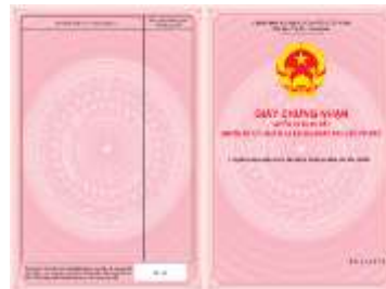
Certificates of land use rights