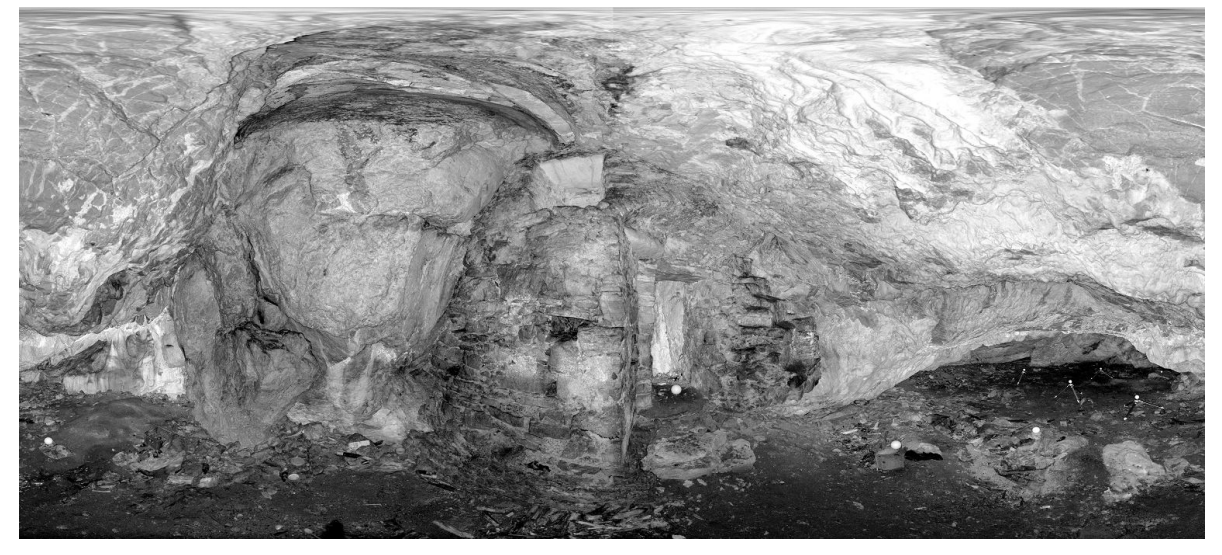
Figure 2. 3D scan of the inside of the cave Kuća

His window of survey is 360^{\circ} horizontally and 120^{\circ} ( 240^{\circ} two-sided) vertically, the acquisition rate is up to 976 000 pps, with the accuracy of \pm 2 mm at 25 m. This type of scanner relies on a rotational prism or a mirror that revolves around the horizontal axis, and the entire instrument revolves around the vertical axis by 360^{\circ} .