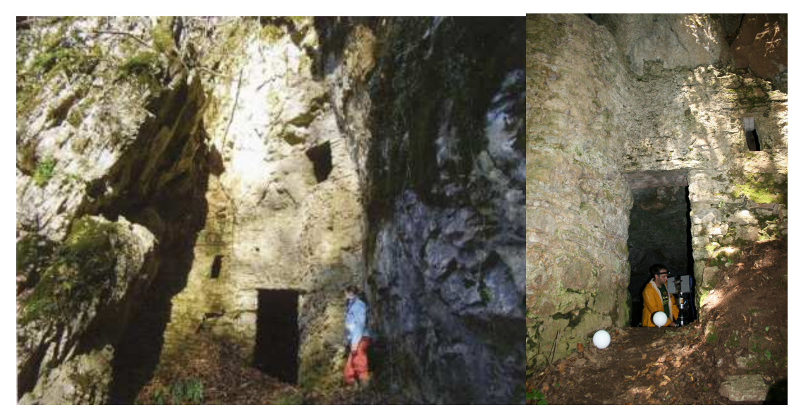
Figure 1: Fortified cave "Kuća"

This small fort was, so far, unknown to public and scientists, and was remembered only in the folklore that says it used to have strong iron doors that were taken to Wien. Another interesting information is that the local population, Croats, hid in the cave for a few days and nights in the autumn of 1991. That information is interesting, as much for recent Croatian history, as much as proof of a continual use of the cave, and a confirmation that the information on such a suitable secret location is transferred, in secrecy, from generation to generation.