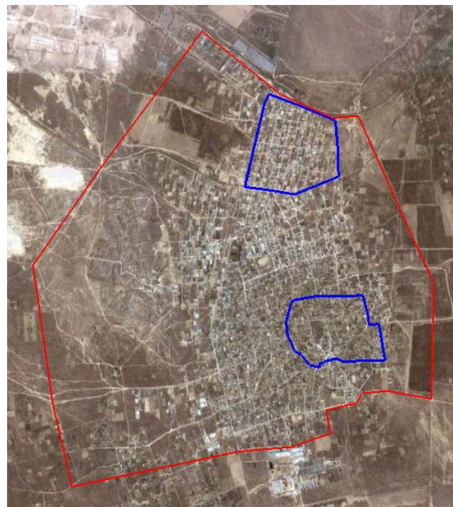
Figure 2: Zira Study Area

(Working Area1: upper, Working Area2: lower )