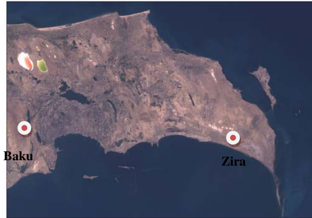
Figure 1: Landsat TM image of Absheron Peninsula.