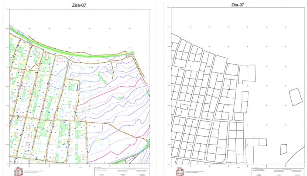
Figure 3 : Topographic map(Left) and Draft Cadastral map(Right)