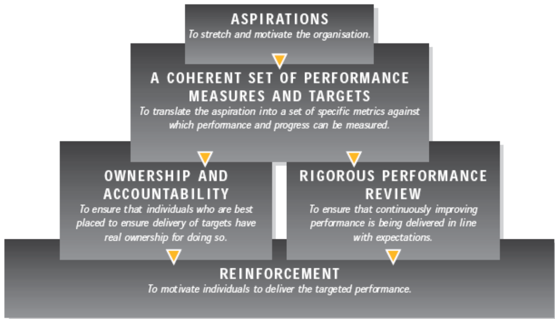
Figure 2: A Performance Management Model (HMT, 2000)