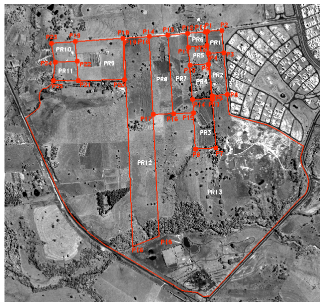
Figure 4-2: Orthoimage of test area.

Figure 4-2 shows the generated orthoimage, in which some properties with rural characteristics were surveyed, in their majority, some being used as country recreation areas or residences.