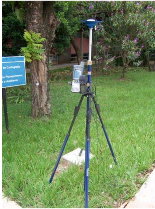
Figure 3-1: Low cost GPS data collection system.

The next procedure was carrying out the geometric correction of the image using the Rational Function Model, a digital model of the terrain and the referred control points, using Leica Photogrammetric Suite (LPS) software.