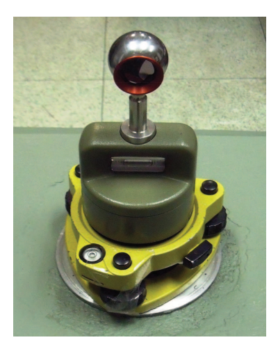
Figure 5 Target Set - Tribrach Topcon, Leica carrier GZR3, Leica prism RRR1.5