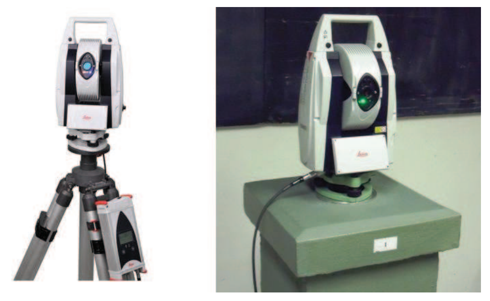
Figure 4 Leica Absolute Tracker AT401

Leica Absolute Tracker AT401 (Fig. 4) and two specially selected tribrachs of Topcon, one carrier Leica GZR3 with optical plummet and one spherical prism Leica RRR1.5 in (Fig. 5) were used for determination of the size of the baseline. The Leica Absolute Tracker AT401 is primarily designed for high-precision engineering measurements. The measurement accuracy is characterized by standard deviations \sigma_{\phi} = \sigma_z = 0.15 mgon for horizontal directions and zenith angles and \sigma_D = 5 \mu m for distances. The maximum range of the distance measurement is 160 m. For the purpose of experimental measurements the Absolute Tracker has been borrowed from the Research Institute of Geodesy, Topography and Cartography of Czech Republic (VÚGTK).