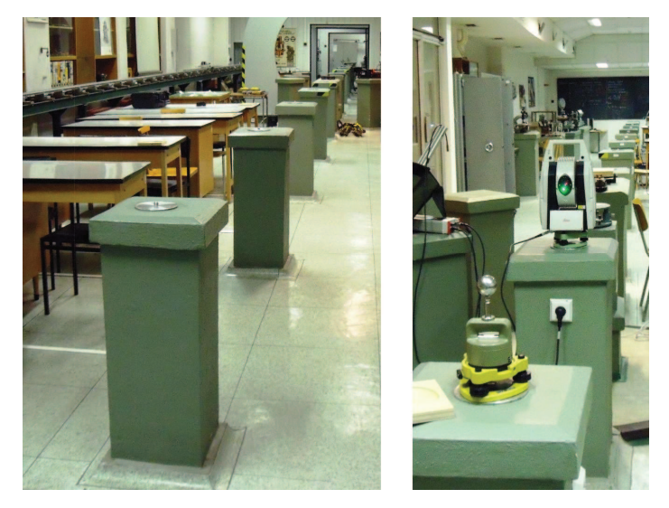
Figure 2 Photographs of the baseline