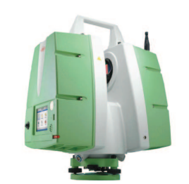
Figure 2 Terrestrial laser scanner Leica ScanStation P20

The scanning was performed from two locations: pillar 5 and station p2 (Fig. 1) which required setting up the scanner on a tripod. Pillar 3 was not used as a station because of certain obstacles blocking a view towards the building. For the purpose of georeferencing square black and white (B&W) targets (14 cm x 14 cm) placed on pillars 1, 2, 3 and 4 were used in case of scanning from