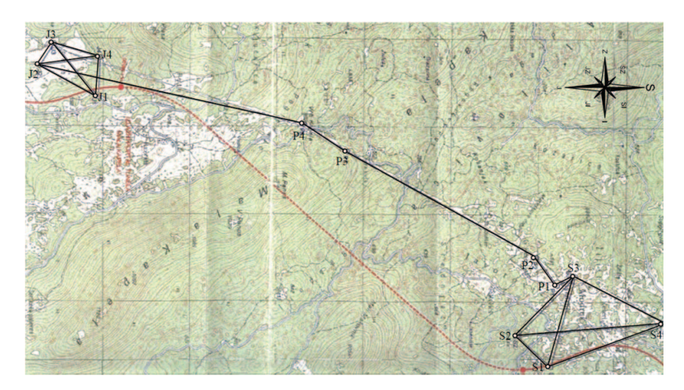
Figure 1 Surface geodetic control and major axis of the tunnel Mala Kapela

For the adjustment of the networks and traverse, software Columbus 3.8 was used. That software, as its output, shows all the precision standards explained before, i.e. Positional and Local uncertainties. Due to limited number of pages of the paper, only Positional and Local Uncertainties of the horizontal coordinates of the northern portal network (Tables 1. and 2.) and traverse is shown (Tables 3 and 4).