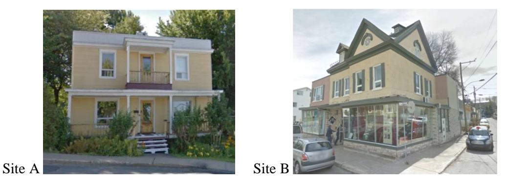
Figure 1. Two apartment buildings surveyed by the terrestrial LiDAR