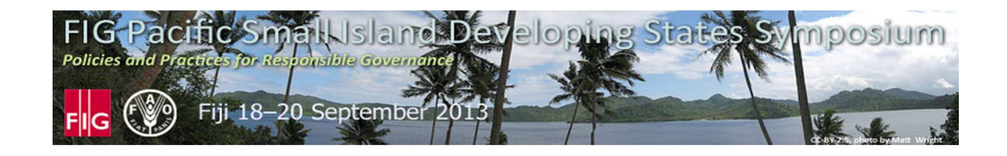
FIG Pacific Small Island Development States