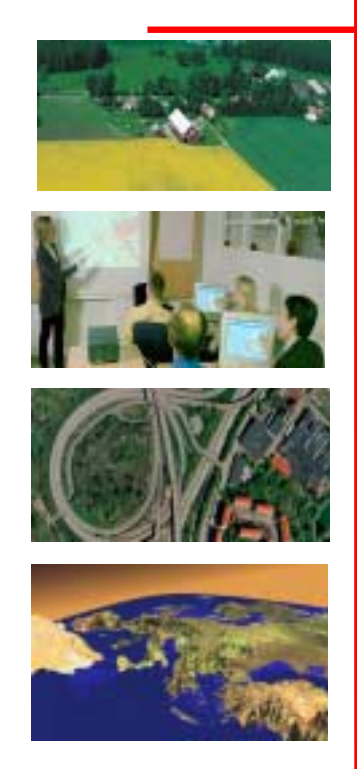
FIG SEM INAR Innsbruck 2-4 June 2004 U lrica O lsson