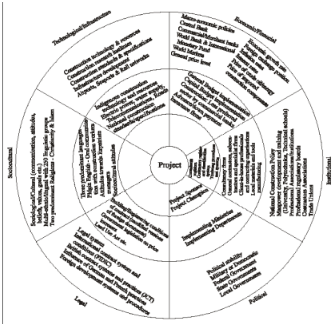
Figure 1 – Project Environment

However, some factors within the environment pose greater challenges to projects, management, and organizational structure than others. These factors should form the focus for the management of the projects environment.