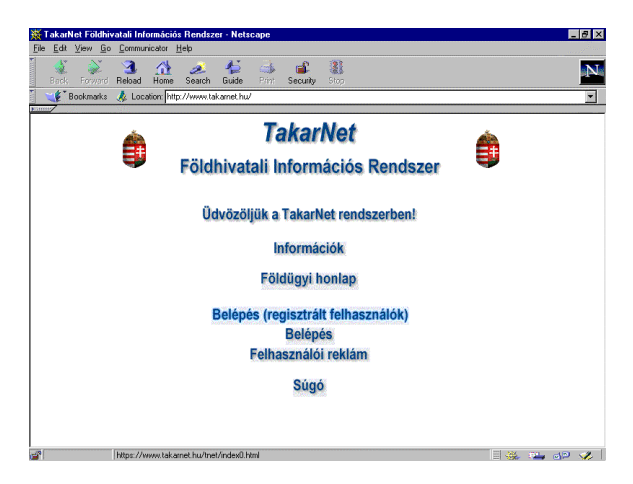
Fig. 2: The entering screen of TAKARNET

After logging on to TAKARNET by entering ID and password, a user can select functions from menus and after completing certain data fields of the WWW pages the software will generate a query which is sent to the relevant land office(s). A response message (data in standardised form) will be the result of the query.