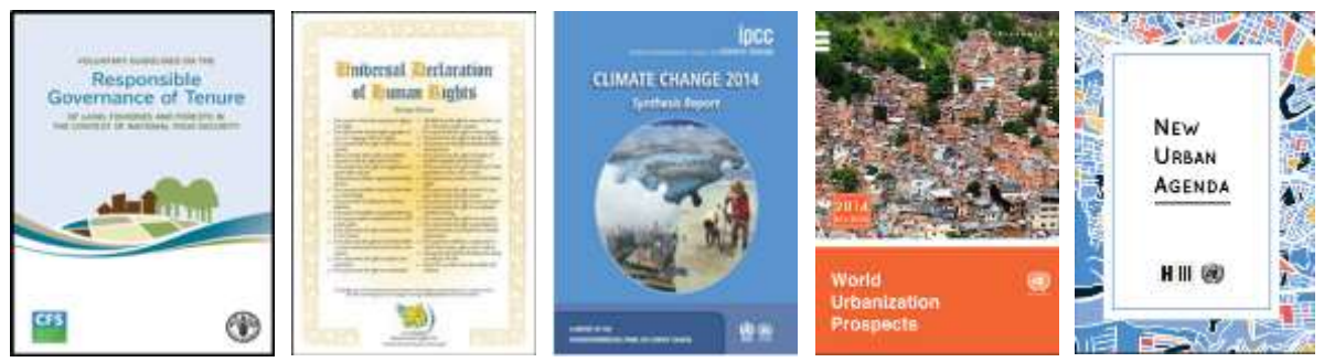
Figure 2. The wider global agenda includes a range of land related issues.

It should be recognised that, next to the SDGs, the wider global agenda includes a range of global issues, such as responsible governance of tenure, human rights and equity, climate change and natural disasters, rapid urbanisation, and the New Urban Agenda – see Figure 2.