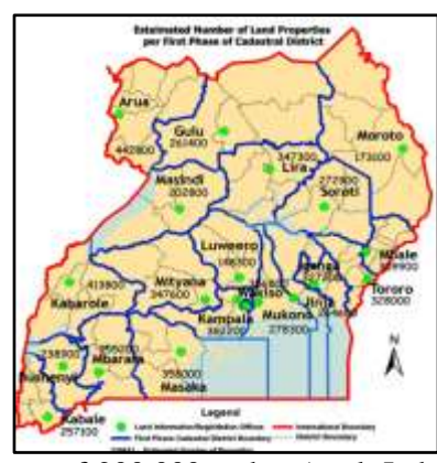
Figure 7. Left: Uganda, with a population of 28.3 million and an area of 200.000 sq.km (excl. Lake Victoria waters), received independence 1961 after 70 years of British colonization. Middle: Land tenure in Uganda is divided between Native freehold 22% (grey), Mailo 28% (yellow) and Customary 50% (green). Right: Cadastral Information Branch Centres providing local access to reliable land information.

Even though the Uganda Land Laws allow for registration of Mailo (bona fide) titles and customary ownership (Certificate of Customary Occupancy) these opportunities are not enforced in practice. However, a number of recent pilot projects, carried out by donors and civil society organisations, have