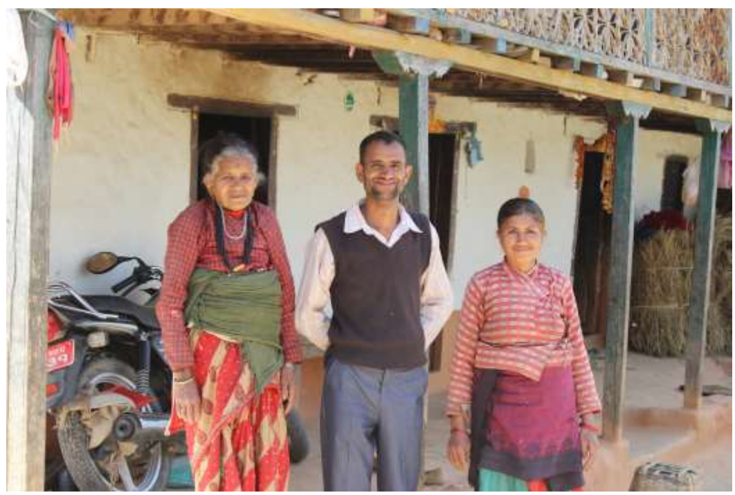
Figure 6. "Land administration is about people". This family in rural areas, about 20 km outside Kathmandu, has occupied a small farm for four generations without any security of tenure to enable investments and improvement of their livelihood.

It is recognized that because of unsecured tenure, the settlers hesitate to invest on the land to improve its productivity, and without investment, production cannot be increased. All these consequences show that the land under informal tenure is causing huge loss to the economy and the valuable land asset is dumped as "dead capital", see Figure 6.