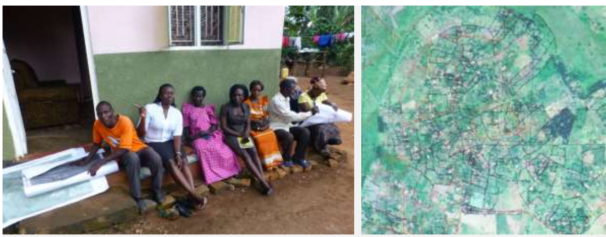
Figure 8. Left: Community people discussing the outcome of a pilot project for registering land rights in the Mailo district of Central Uganda. Right: A satellite imagery showing the mapped parcel boundaries as demarcated though a participatory process.

introduced the FFP concept as a vehicle for efficient and effective systematic registration of land rights for the remaining about 20 million parcels currently outside the formal system. As the challenges are enormous and the capacity of land stakeholders limited, the Global Land Tool Network engages in Uganda to scale up pro-poor land interventions in order to contribute to the achievement of tenure security for all, see: <a href="https://gltn.net/home/country-work/#uganda">https://gltn.net/home/country-work/#uganda</a>.