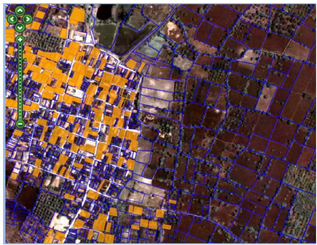
Figure 4. Example of demarcation of land parcels using high resolution imagery. Wotan Village, Gresik District, East Java Province, Indonesia

Experience from this kind of FFP piloting looks very promising, even though the legal & regulatory frameworks will have to be adjusted in order to allow for mandatory registration as part of the participatory process of boundary identification. Overall, the benefits of implementing the FFP approach can be summarised as shown in Table 2: