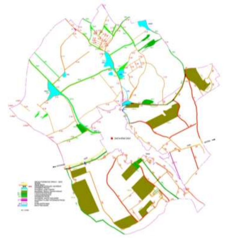
Figure 1. Example of Common Facilities Plan

Common Facilities Plan (CFP) must tally to the Urban Planning Documentation (UPD), otherwise the CFP represents a propound for actualization or a change in UPD. If it is necessary to provide an area of land fund for common facilities, firstly is used land in ownership of state and then in the ownership of municipality. Finished CFP has to be passed by the municipality council and other involved authorities are expected to apply their objections. Municipality council also defines the priorities in implementation of realizations of the proposed measures.