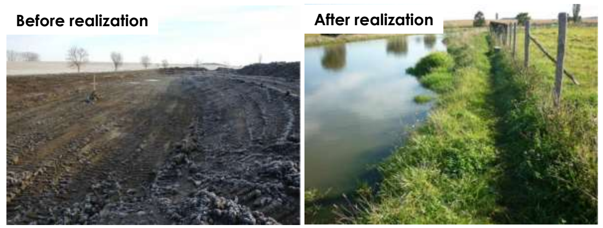
Figure 4. Example of ecological measure

To this category belong measures like local system of ecological stability (biocenters, biocorridors), interaction elements, small water pools, wetlands (Fig.4) etc.