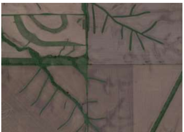
Figure 7. Stabilization of the paths of runoff

3) Technical measures – sedimentation reservoirs, ditches, stabilization of the paths of runoff (Fig. 7), infiltration zones, terraces, windbreaks etc.