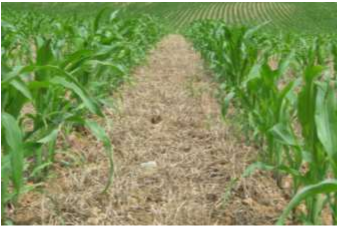
Figure 6. Seeding into protective crop

2) Agrotechnical measures – growing measures, grassing between fields, seeding into protective crop (Fig. 6), leaving crop residues etc.