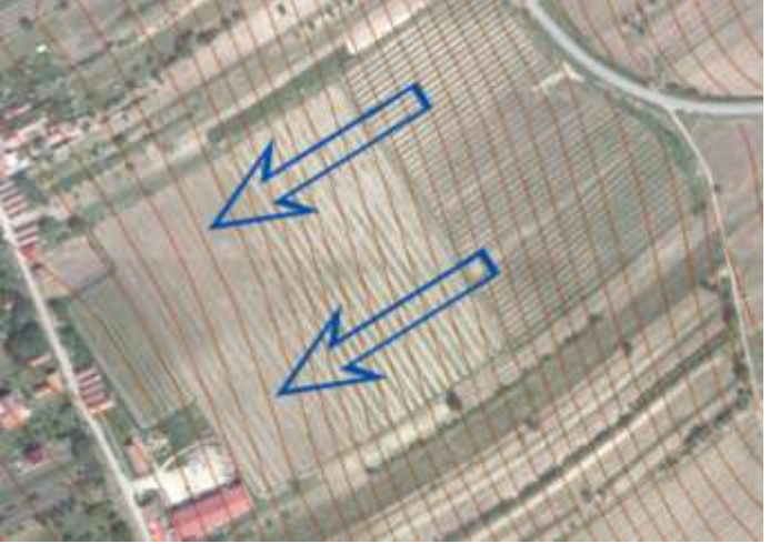
Figure 5. Change of land use (arable / vineyard with anti-erosion function)

1) Organizational measures – grassing, foresting, shape and size of the parcels, rotation of crops on the soil, change of land use (Fig. 5) etc.