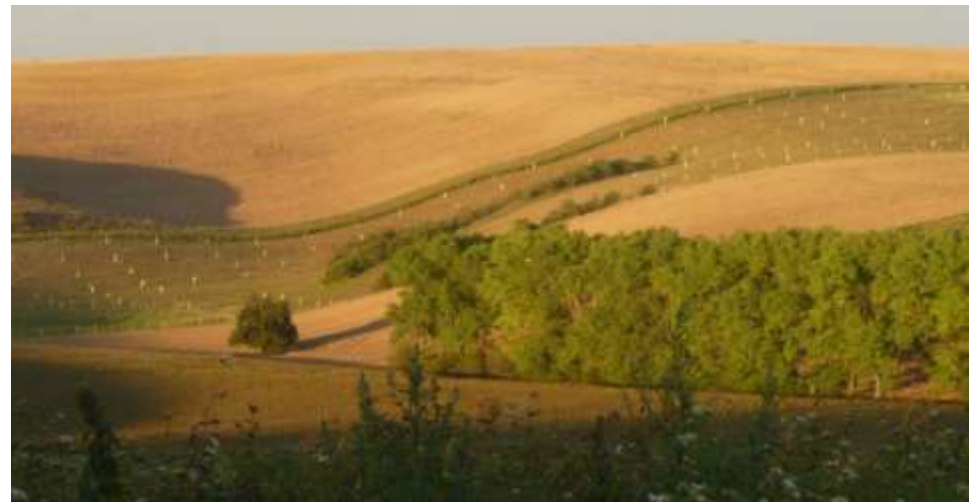
Figure 2. Erosion control belt with a planting