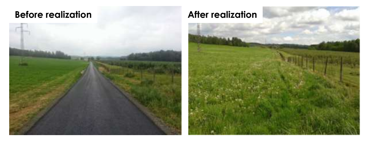
Figure 3. Example of measures for land accessibility

These measures are trying to solve the principles of the proposed concept of the transport system and in the same time it includes relations with the transport system network with the higher order. The proposed transport system and its technical parameters must be in accordance with the valid technical standards and regulations. This transport system also has to fulfill the requirements for the movement of the agricultural vehicles, enable the rational agriculture and other use out of agricultural transport. Measures which provide land accessibility include field or forest roads (Fig. 3), small bridges, fords, railroad crossings etc.