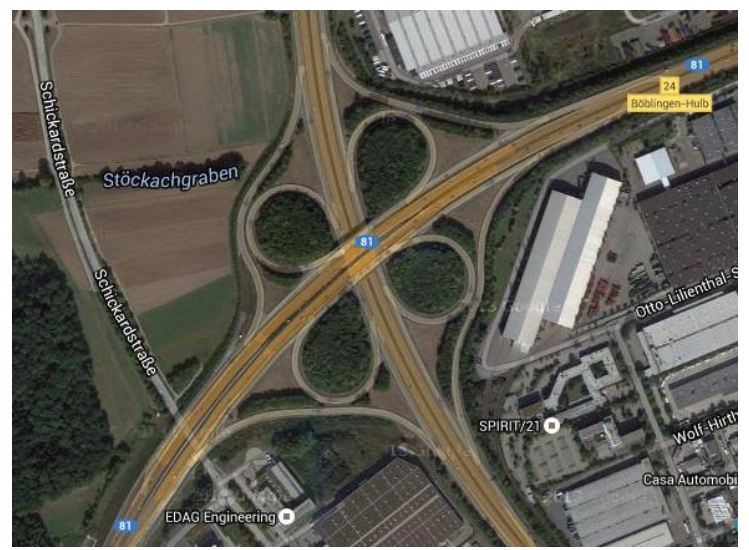
Fig. 1: Autobahn junction Böblingen-Hulb on Google Maps Satellite View

For the evaluation of absolute positional and shape accuracy of road segments in the given digital maps and hence the comparison of map quality between commercial, official and free datasets, precise kinematic reference trajectories based on differential carrier-phase GNSS positioning were generated using a high-end geodetic GNSS two-frequency receiver (Leica Viva GS15) mounted on a land vehicle with CS15 field controller. The final coordinates of the kinematic GNSS tracks in the Universal Transverse Mercator (UTM) system with accuracies better than 10 cm were computed by a specialized GNSS baseline processing software, named Wa2 (Wa2, 2015), which provides a reliable and precise offline solution as well as a detailed output protocol.