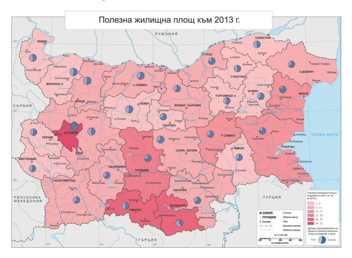
Figure 4 . Map of useful living area for 2013.

is the useful living area of the housing fund. Map of the housing fund - useful living area - for the year 2013 is shown in figure 4. The map representing useful living area for 2013 (figure 4) shows larger proportion to the cities – the largest one is in Sofia (29-32 mln m²), followed by Smolyan, Kardzhali (24-29 mln m²), Plovdiv (17-24 mln m²), Sliven, Varna and Burgas (11-17 mln m²). Again one can see that the largest useful living area of the housing fund is documented logically in the capital as well as in Plovdiv – both cities fall in the zones of most severe seismic hazard in Bulgaria.