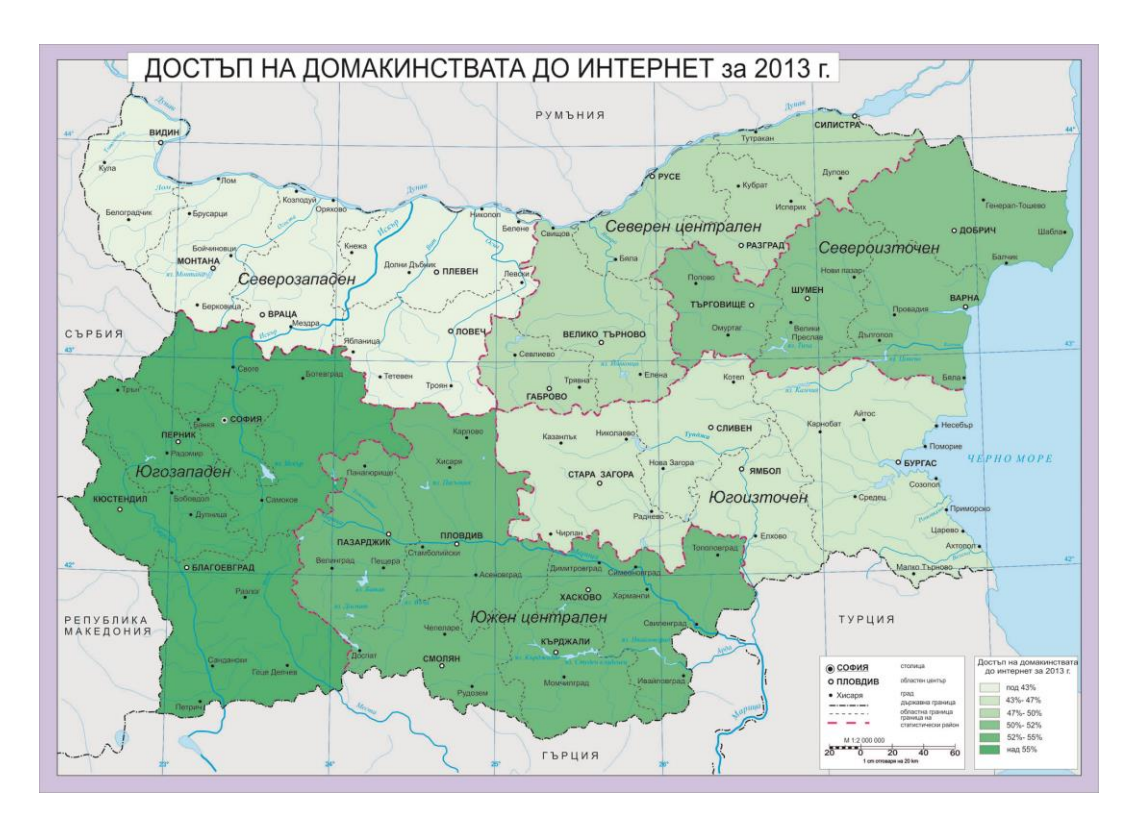
Figure 7. A map presenting household access to the Internet for 2013