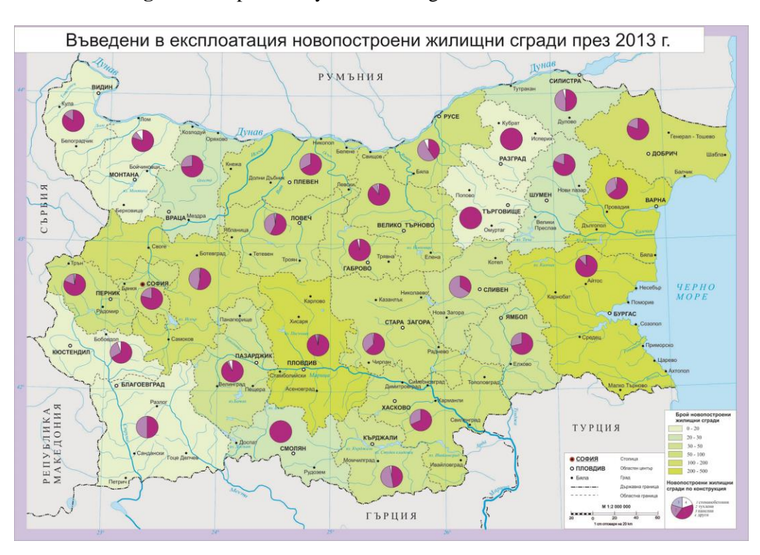
Figure 3. Map of newly built housing constructions for 2013.

Another quantity that is indirectly related to loss evaluation and earthquake insurance industry