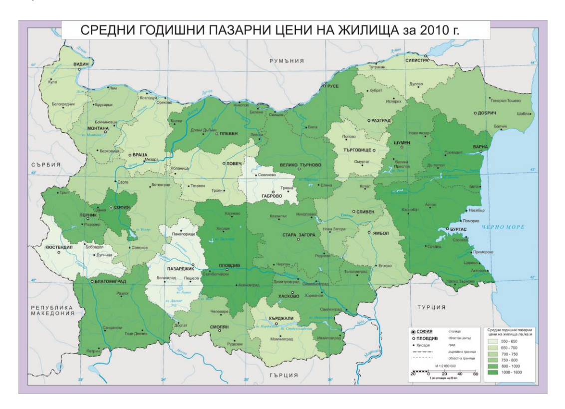
Figure 6. Map of average annual prices for housing for 2010