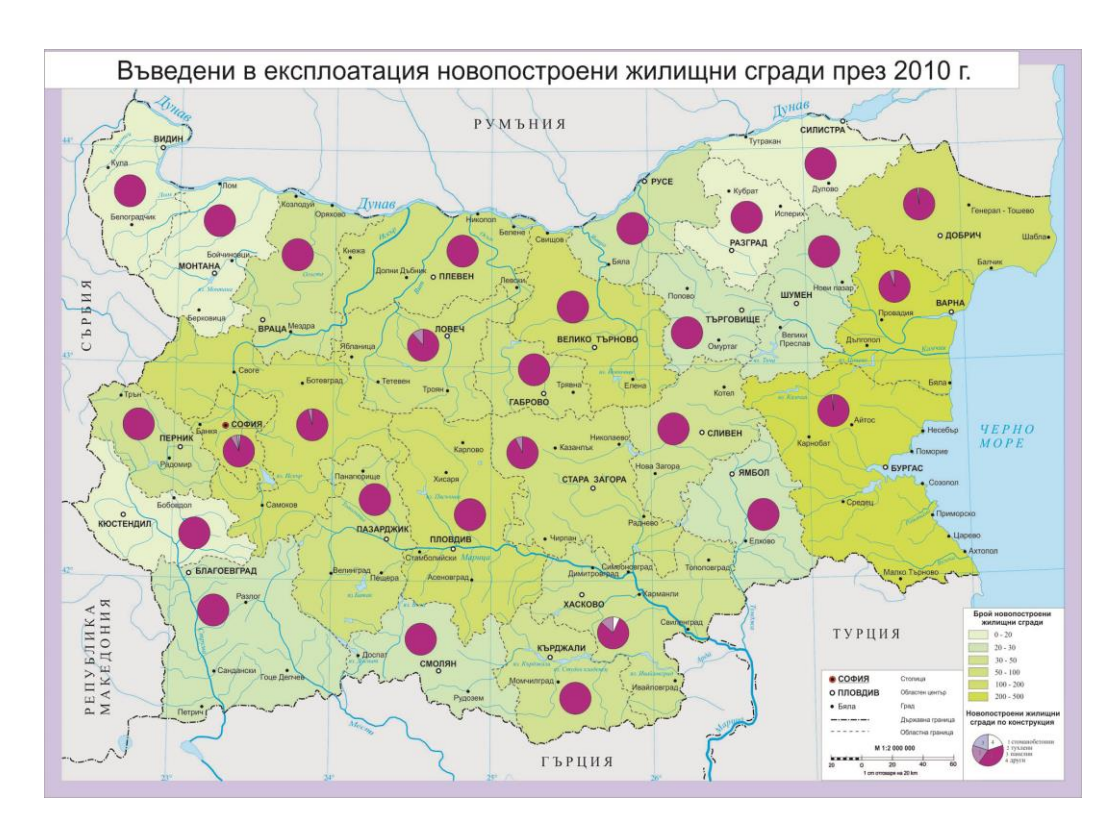
Figure 2. Map of newly built housing constructions for 2010.