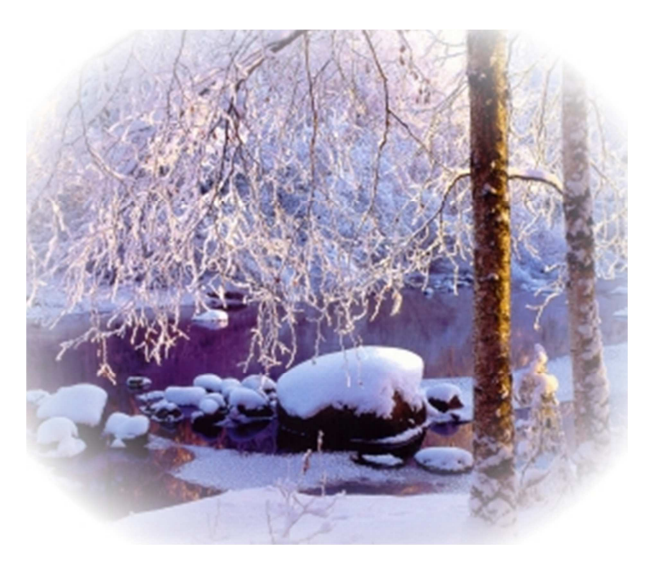
FIG Office wishes you:

Welcome to the FIG e-Newsletter, which brings you latest information about FIG and its activities. The information referred here is in full length available on the FIG web site. Thus the e-Newsletter is produced to inform you what has happened recently and what interesting things are going to take place in the near future. The FIG e-Newsletter is circulated monthly or bi-monthly by e-mail. The referred articles are in English and written in a way that you are able to extract them to your national newsletters or circulate to your members and networks.