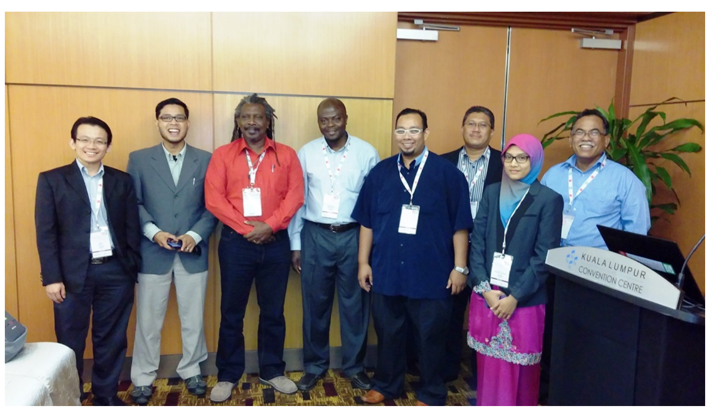
Speakers from the Marine Spatial Information Management Technical Session