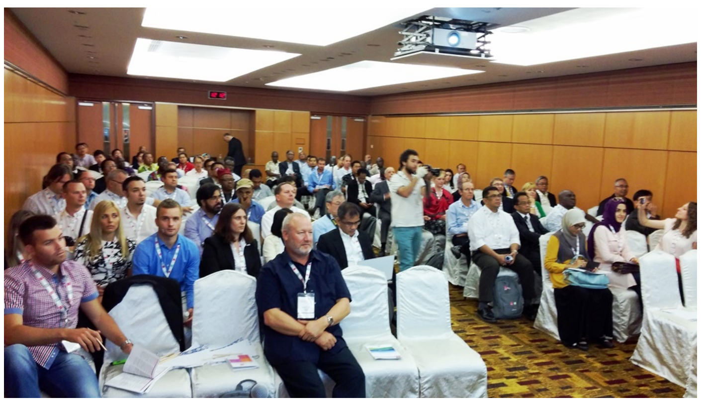
Some Attendees at a Commission 4 Technical Session

The technical sessions were well attended, and attendees made significant contributions through questions and comments. Some sessions had as much as 90 attendees.