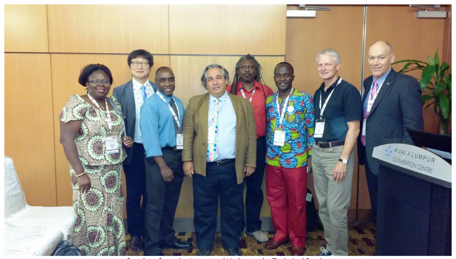
Speakers from the Integrated Hydrography Technical Session