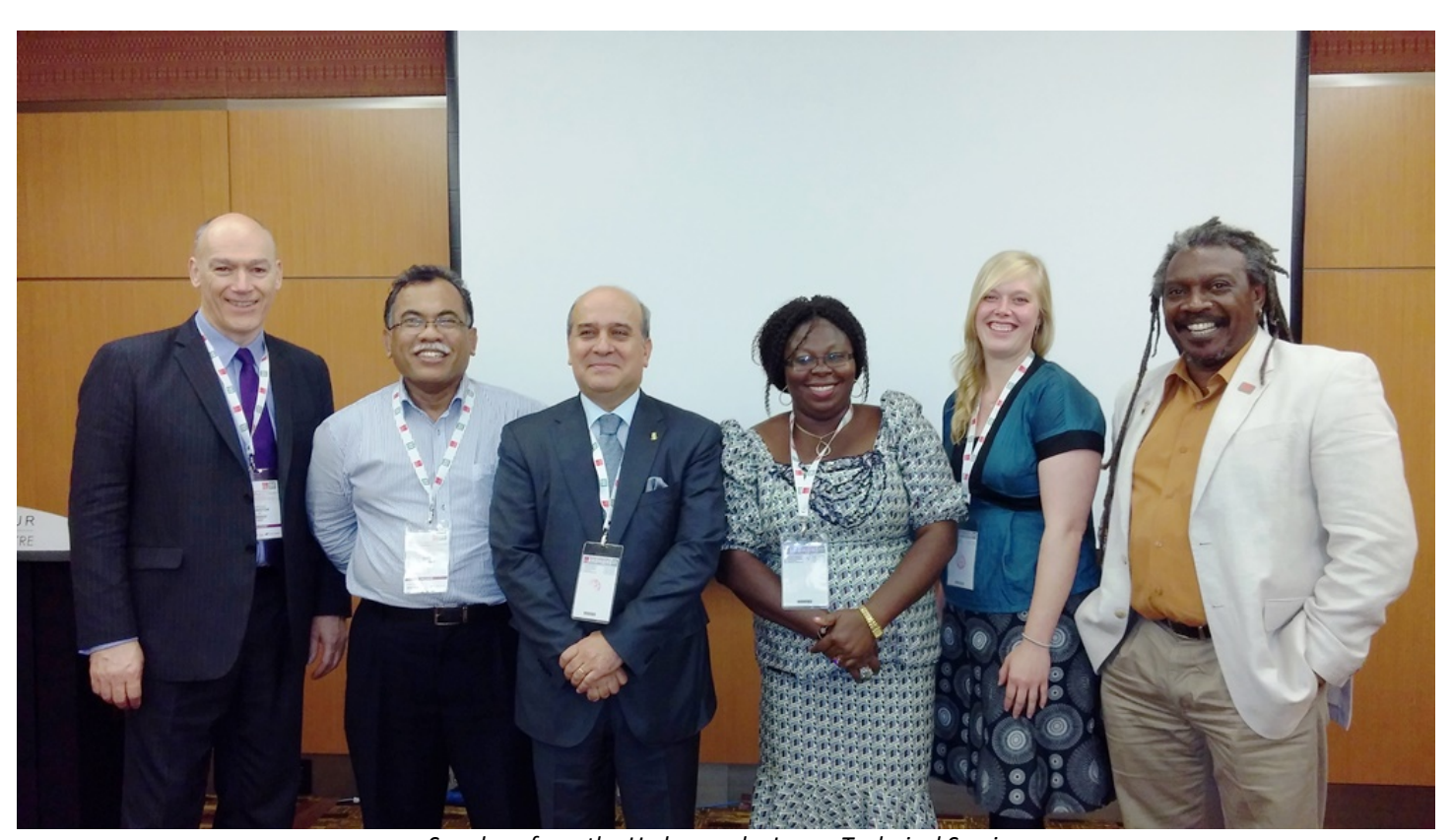
Speakers from the Hydrography Issues Technical Session