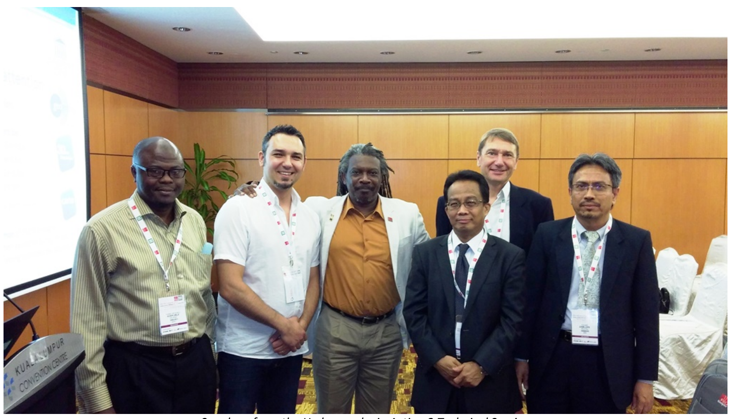
Speakers from the Hydrography in Action 2 Technical Session