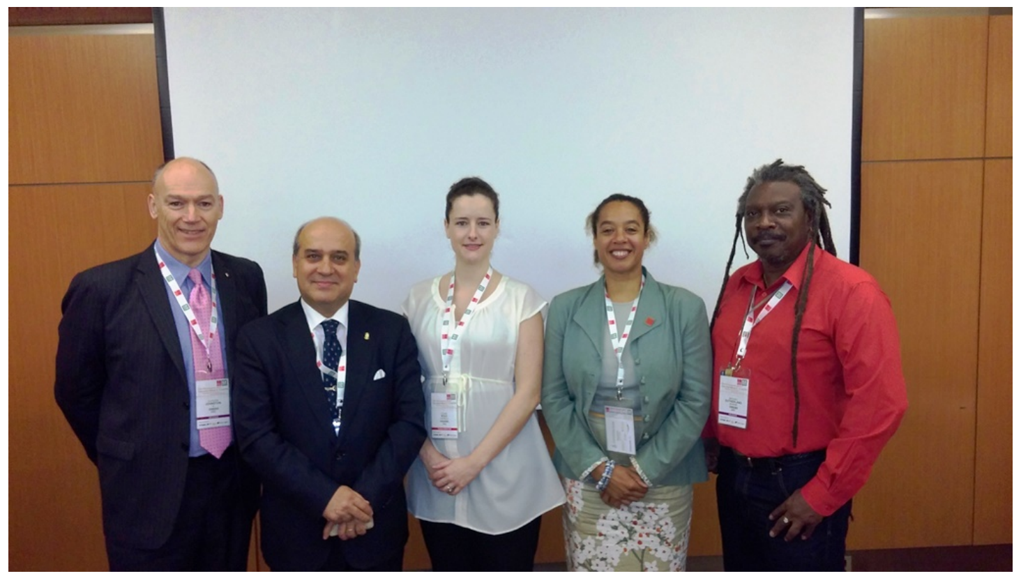
Speakers from the Blue Economy Technical Session

Of significance was the participation of "Young Hydrographers" as part of FIG's Young Surveyors' Network. These young people represent the future of Commission 4. Let us encourage and support them.