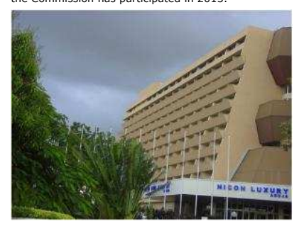
FIG Working Week 2013, Abuja, Nigeria

2013 represents the penultimate year of the current 2011-2014 term. Below are two main events in which