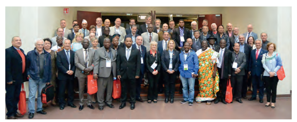
The Presidents' Meeting with all the presidents/heads of representation.