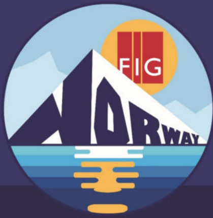
FIG Working Week 2027