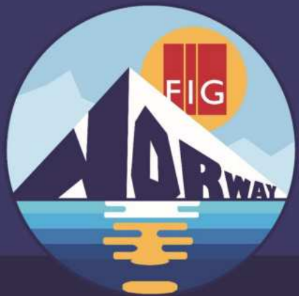
FIG Working Week 2027