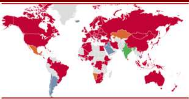
FIG Members Associations Corporates Academics Affiliates Correspondents Honorary Presidents Honorary Members Honorary Ambassadors

Sustainability is about making sure that both internal and external partnerships are working effectively and cultivating stronger engagement