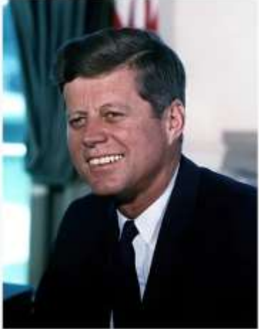
Oval Office portrait, 1963

“Beware of the Danger; but recognise the opportunity” JF Kennedy