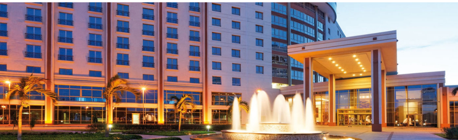
Movinpick Hotel, Accra