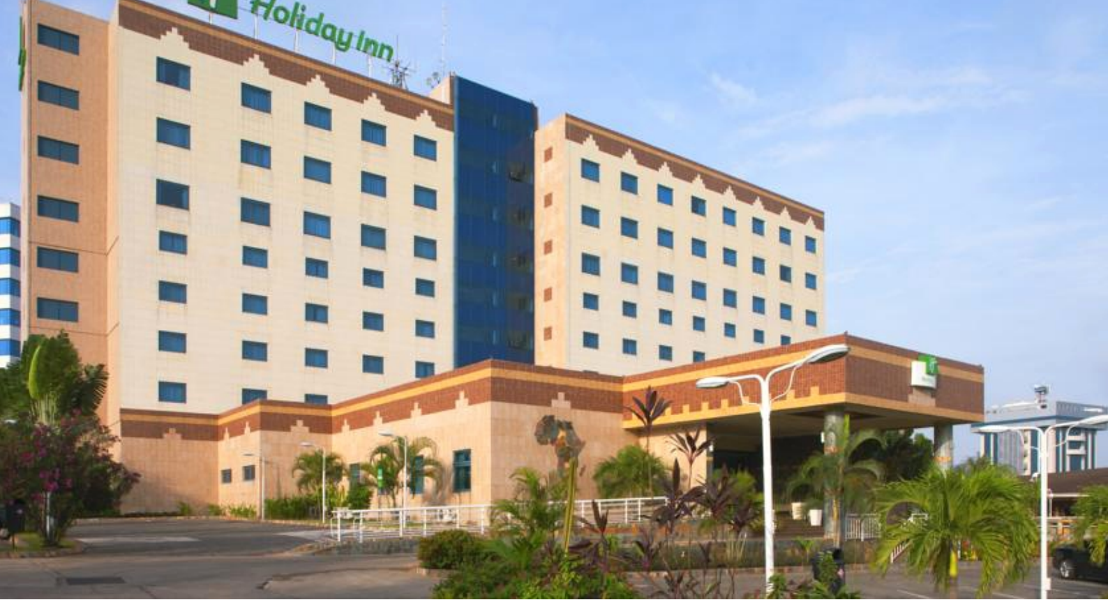
Holiday Inn Hotel, Accra