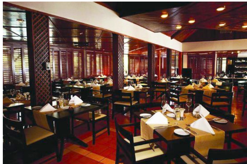
Labadi Beach Hotel, Accra

The city is acknowledged to have fewer tourist attractions than the other capital cities but both James Town and Osu in Accra have been recognized as having “a certain fading charm, while the frenzied market area and even more Adabraka are vibrantly brashly modern without feeling in any way threatening.”