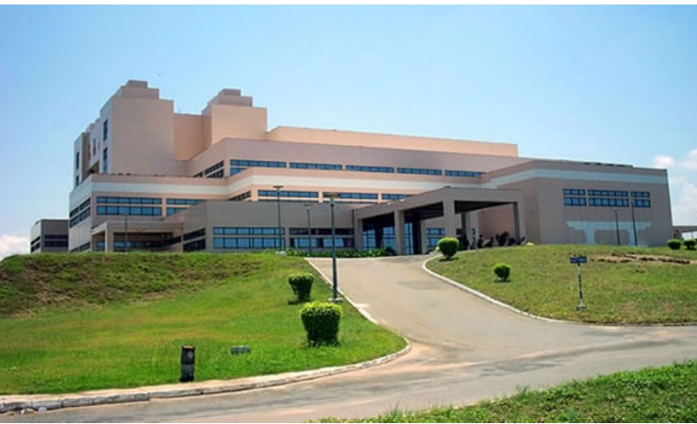
A view of the Accra International Conference Centre (AICC)