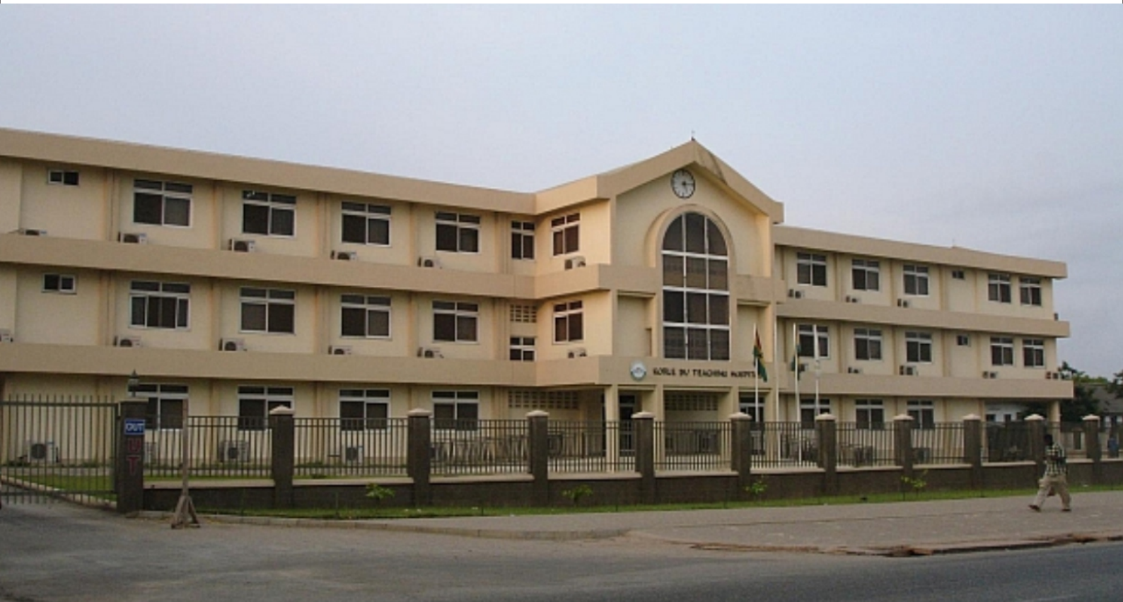
A view of Korle Bu Teaching Hospital