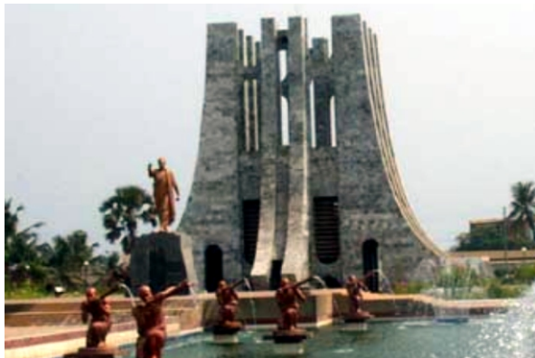
View of Dr. Kwame Nkrumah Mausoleum

In 1693, the Christianborg Castle had its first black governor! Asimani of Akwamu in the Eastern Region of present Ghana entered the fort, overpowered the occupants, and governed it for close to a year, after which he sold it back to the Danes. But he kept the keys, which still form part of the Akwamu State regalia.