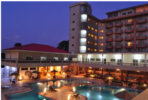
Mensvic Grand Hotel, Accra