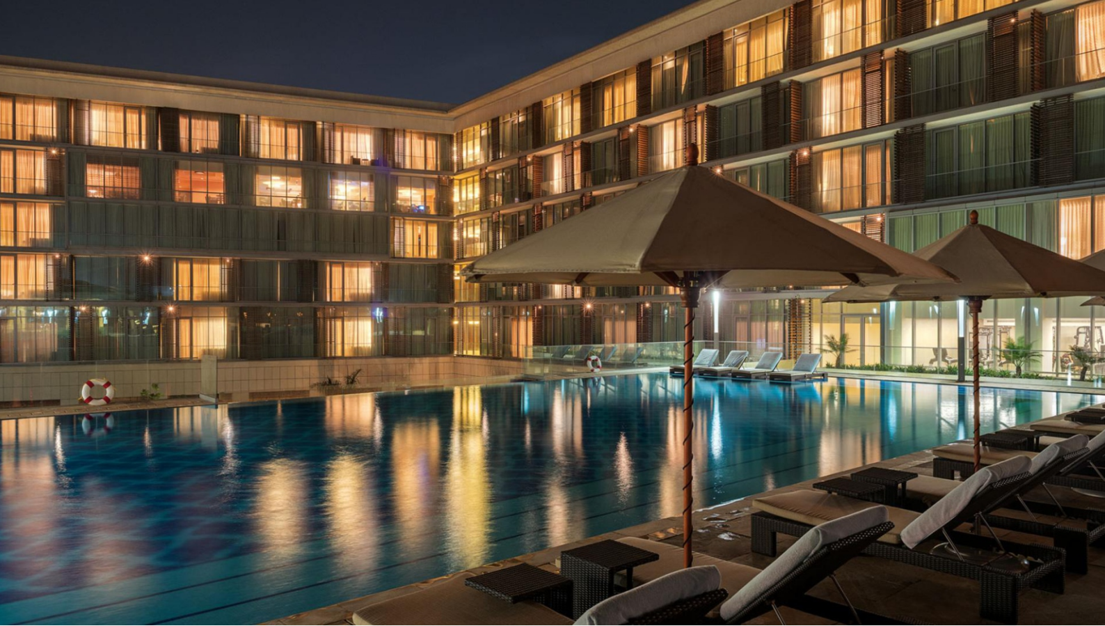
Kempinski Hotel, Accra