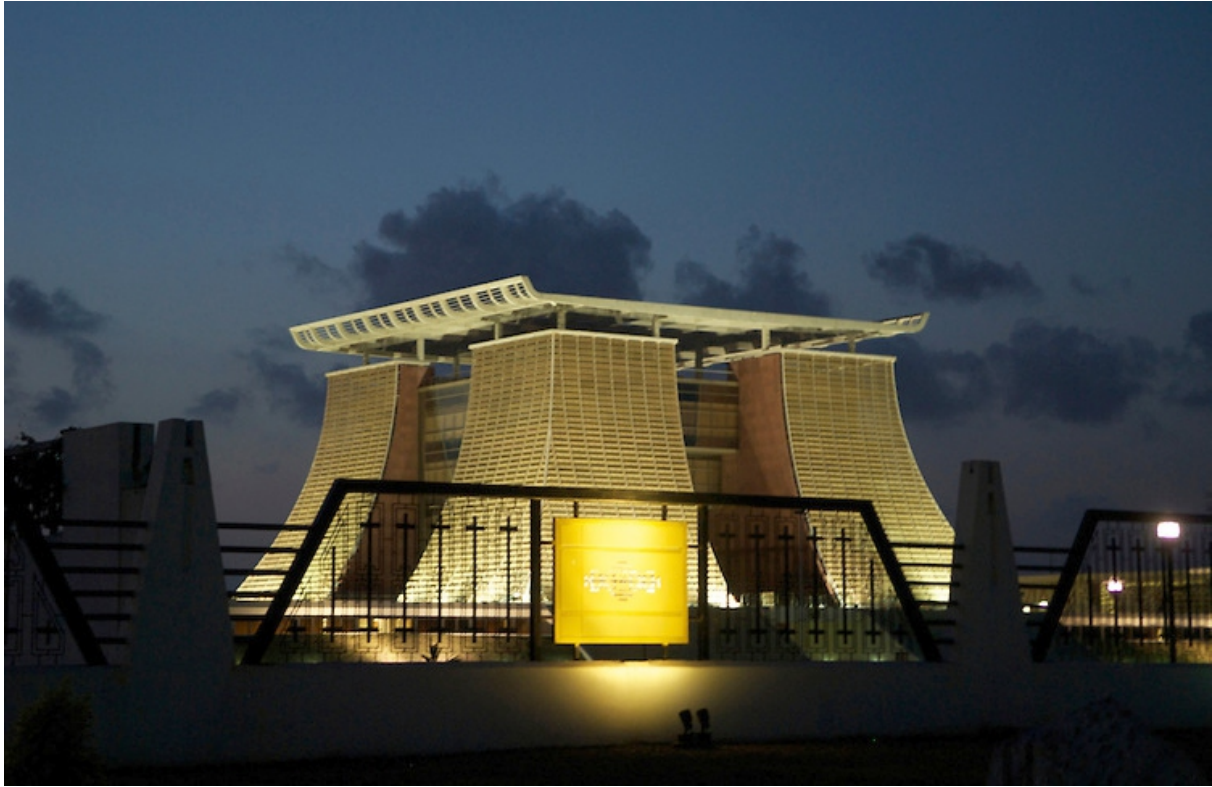
The Flagstaff House, Accra