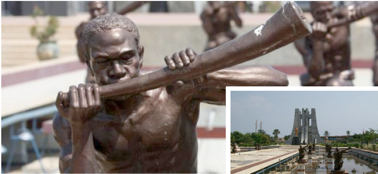
Statues at Kwame Nkrumah Mausoleum

since Ghana's independence in 1957, including Vice President (later President) Richard Nixon of U.S.A. Additional rooms were built on the North Eastern corner in 1960 for Queen Elizabeth II's visit in 1961. These rooms were also to host the Prince of Wales, heir to the British throne, in 1977.