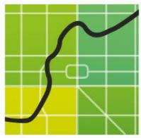
FIG Working Week 2016