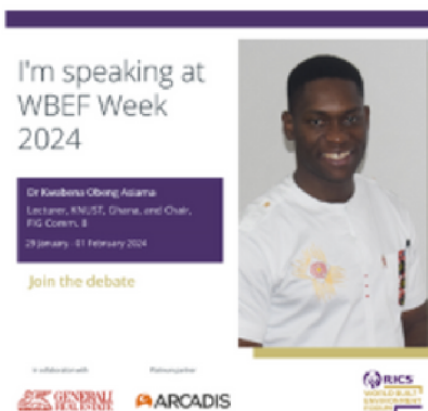
FIG COMMISSION 8 WG8.3 WEBINAR

FIG Commission 8, WG3, is planning its first webinar via the FIG Zoom platform on 4th April at 2pm CET. Under the theme, “Climate-smart land use planning - towards flood and drought resilience”, the webinar will feature four speakers from various backgrounds including climate change, spatial planning, and natural disaster risk management. During the webinar, the invited experts will share their knowledge of adaptive spatial planning tools that can help face climate change mitigation and adaptation challenges. The webinar will provide space for knowledge sharing and discussing our challenges. We will be looking to answer the question: what could the surveyors' role be in these processes? Register using the QR code to the left.