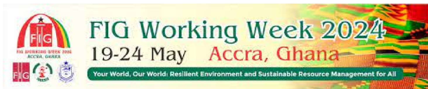
FIG Commission 8 will be participating fully, with technical sessions within the commission, with each working group having a session in the Working Week, as well as sessions in concert with other commissions and task forces. The key technical focus for the commission during the working week will be "Leveraging land and marine spatial planning for greater resilience". We hope to also socialise with you during our commission dinner in the week. We look forward to welcoming you to Accra. For more information, kindly follow this link: https://www.fig.net/fig2024/index.htm .

If you've made it this far, then why don't you join our LinkedIn page and WhatsApp Community so we can be updated on all Commission 8 related activities. We welcome any updates - from telling us about technical or thought leadership presentations you've been doing, papers you've been working on which are relevant to Commission 8, please do share photos and a paragraph or two with us at figcommission8@fig.net and/or in our WhatsApp Community ( https://chat.whatsapp.com/BFCmt0zNLV0G7Ov1FLCFbu ).