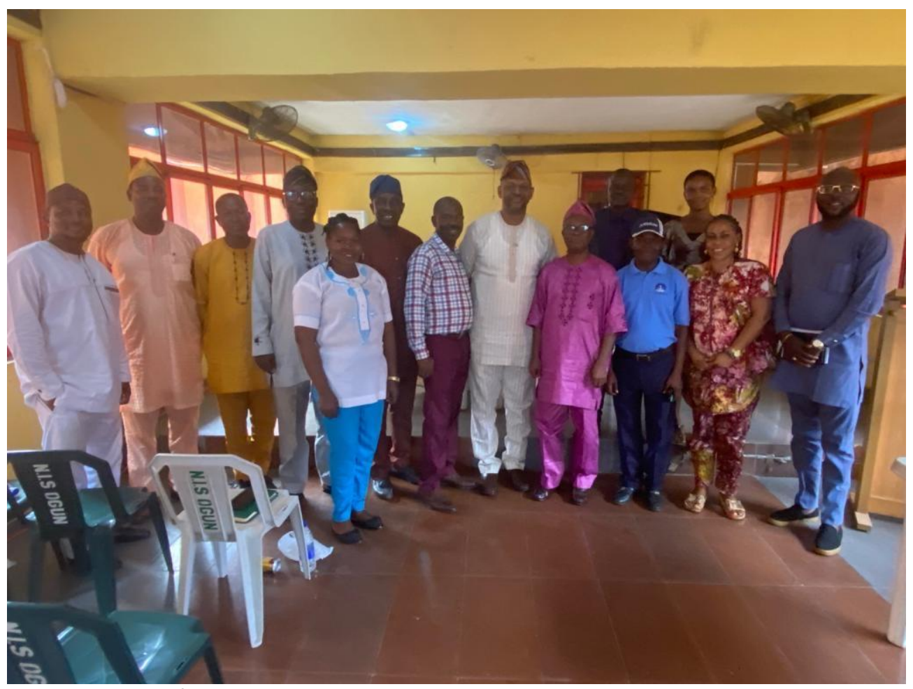
Group photograph of the participants