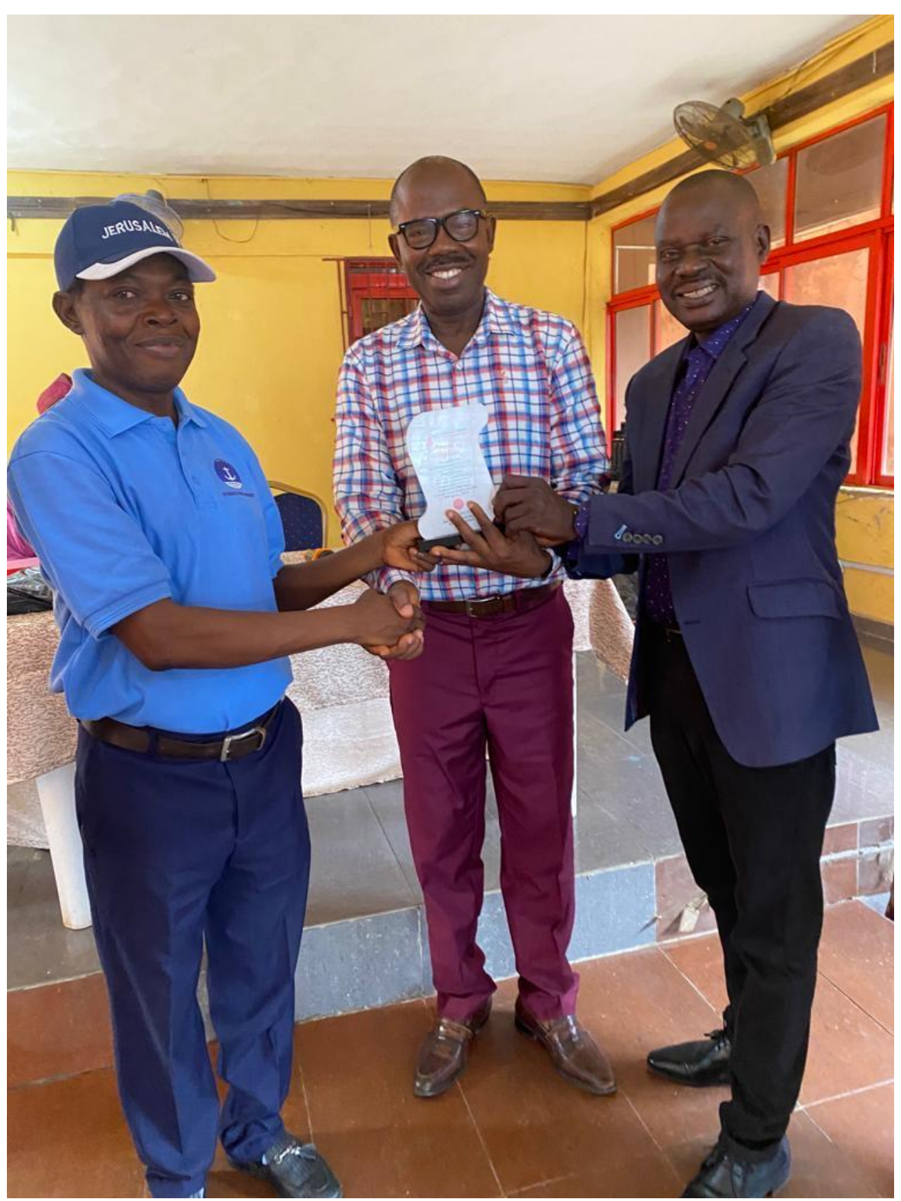
Plaque award to the Hosting State (Nigerian Institution of Surveyors, Ogun State Branch)