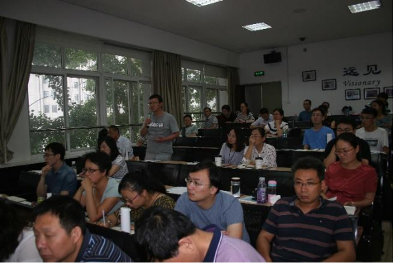
Summer School at Renmin University, China