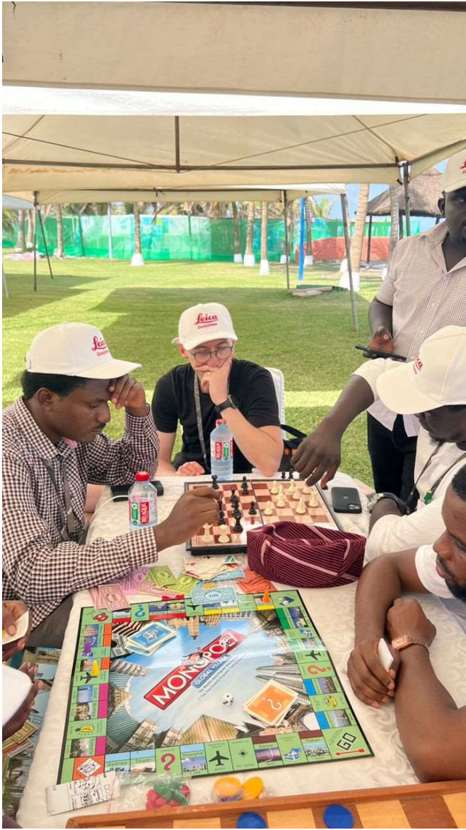
FIG YSN Charity Event