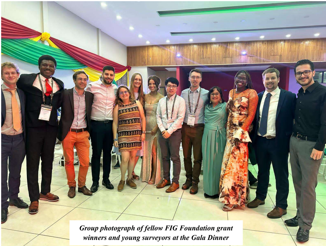
Group photograph of fellow FIG Foundation grant winners and young surveyors at the Gala Dinner