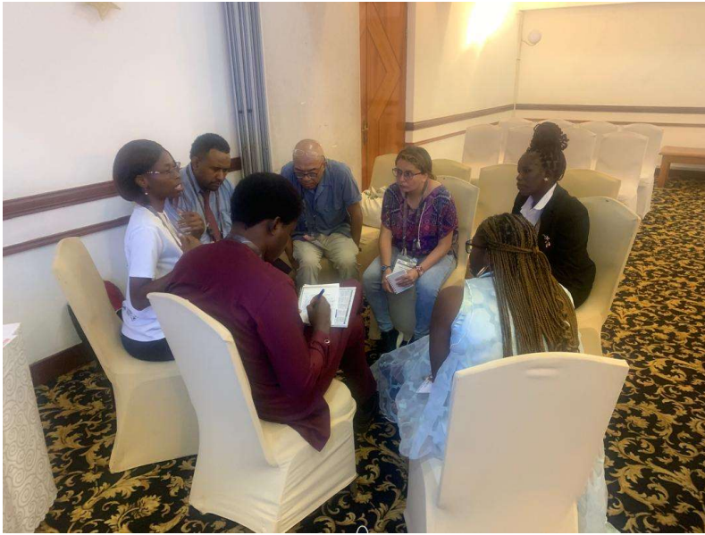
Brainstorming during a session at the FIG Working Week