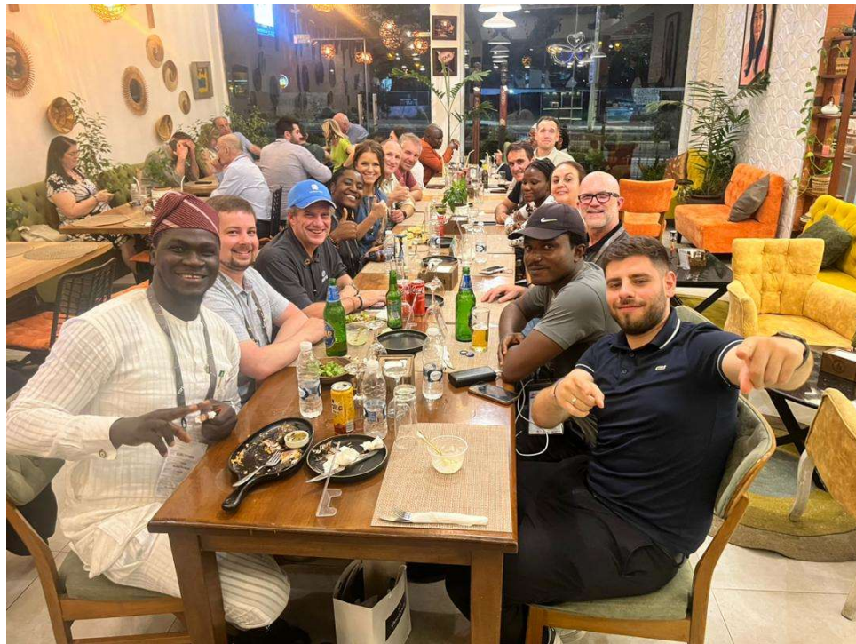
Commission 2 dinner group photograph