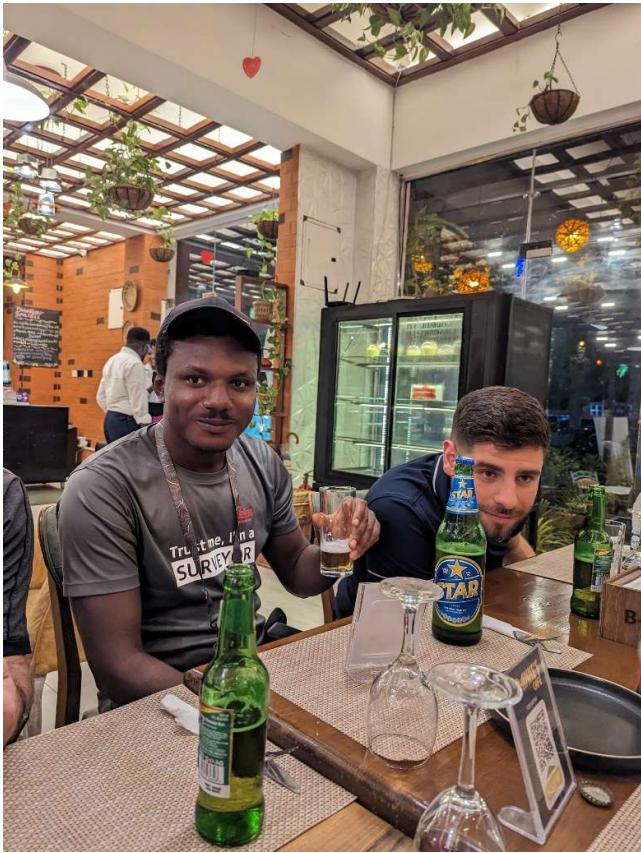
Having a great time at the Commission 2 dinner