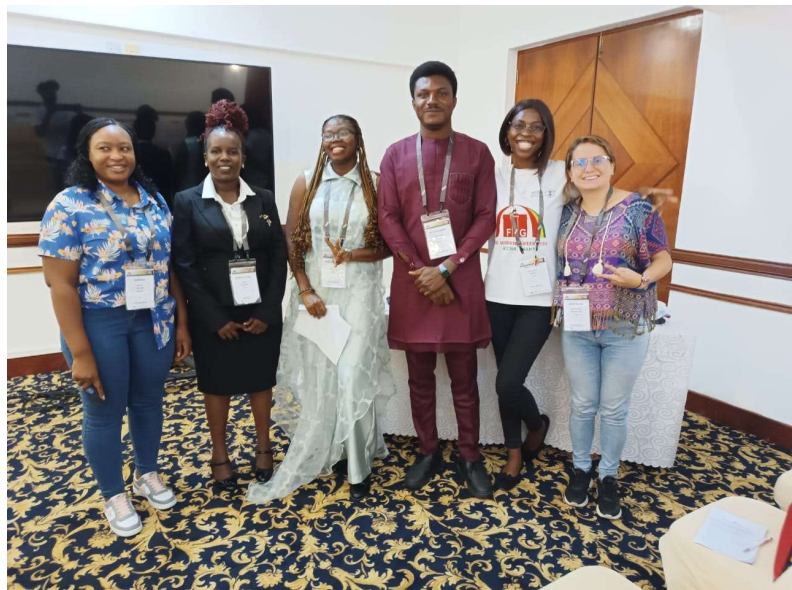
Photo with group members at the end of a session at the FIG Working Week