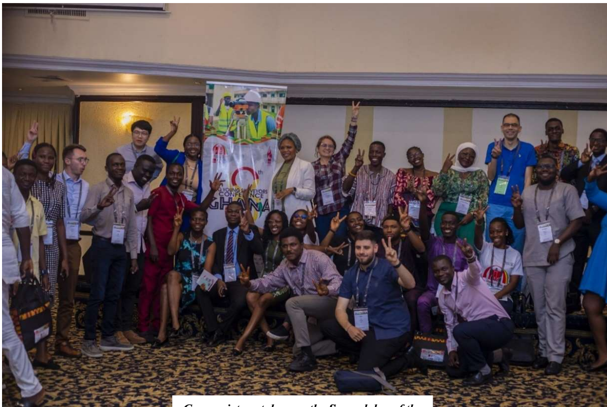
Group picture taken on the Second day of the FIG YSN Conference