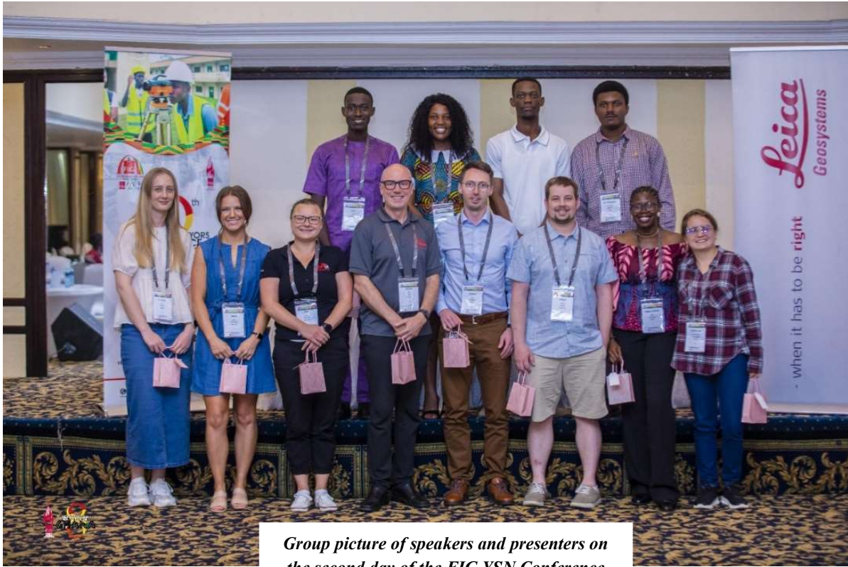
Group picture of speakers and presenters on the second day of the FIG YSN Conference