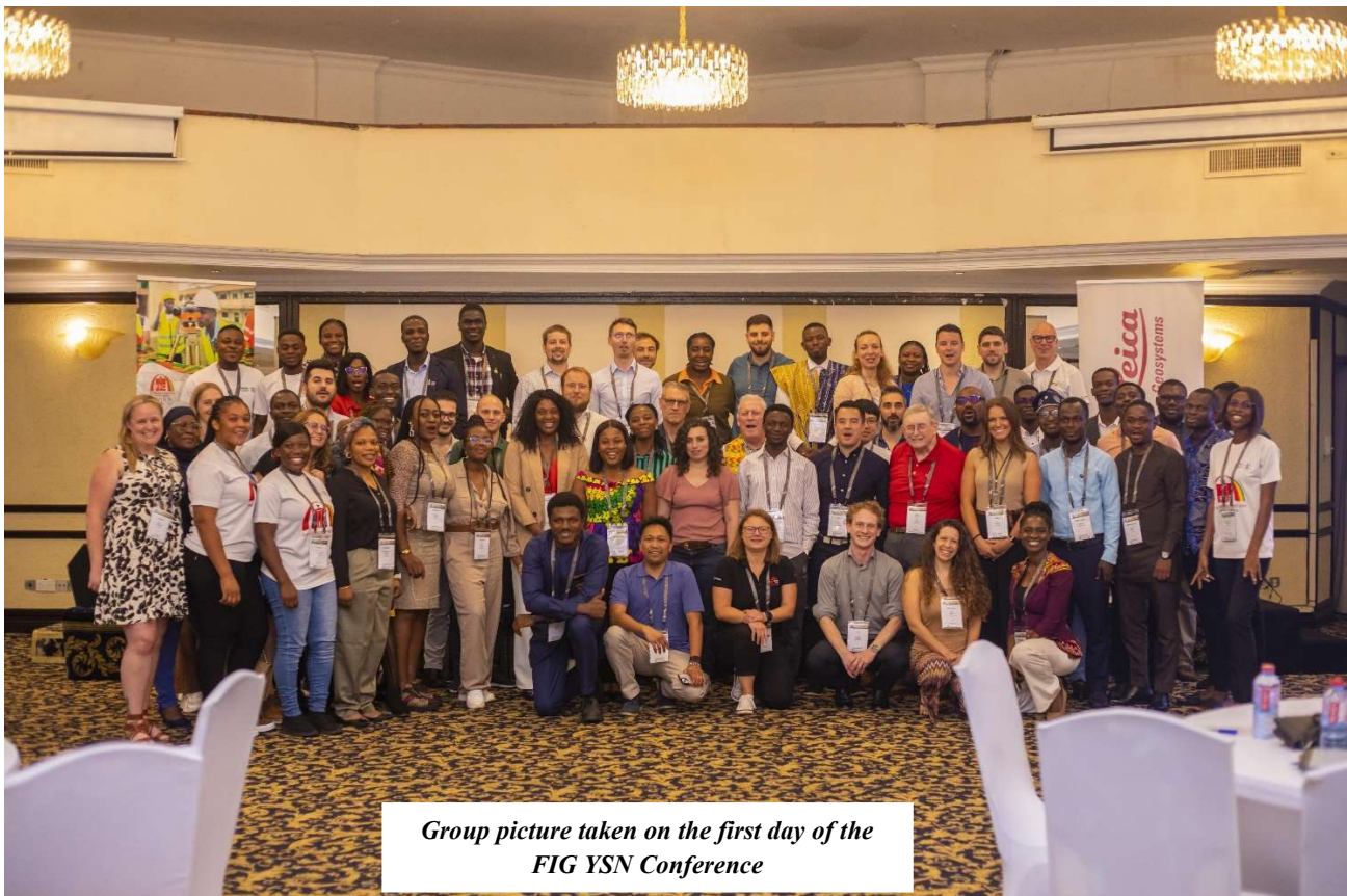
Group picture taken on the first day of the FIG YSN Conference