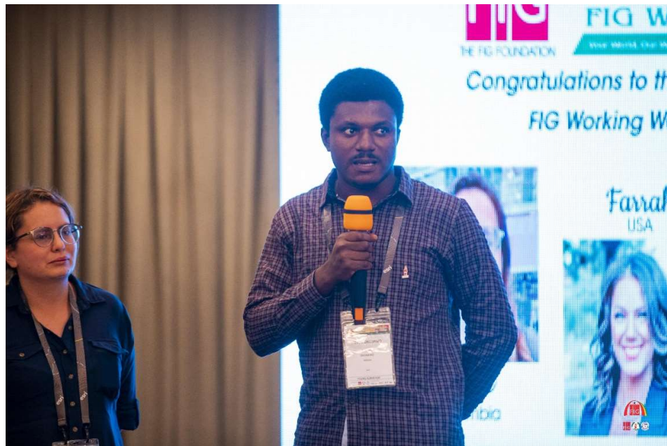
And it was my turn to make a speech